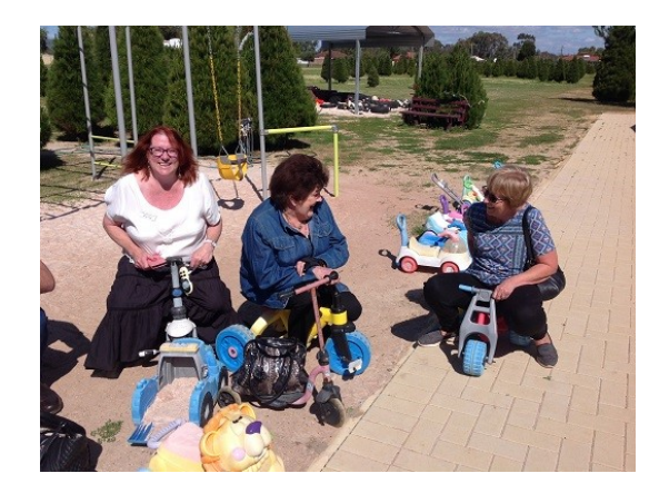
Bigger bikes perhaps?