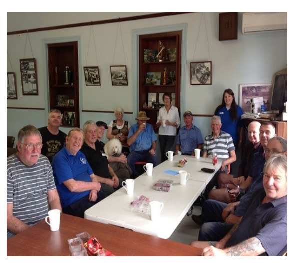
Busy Bee Morning Tea