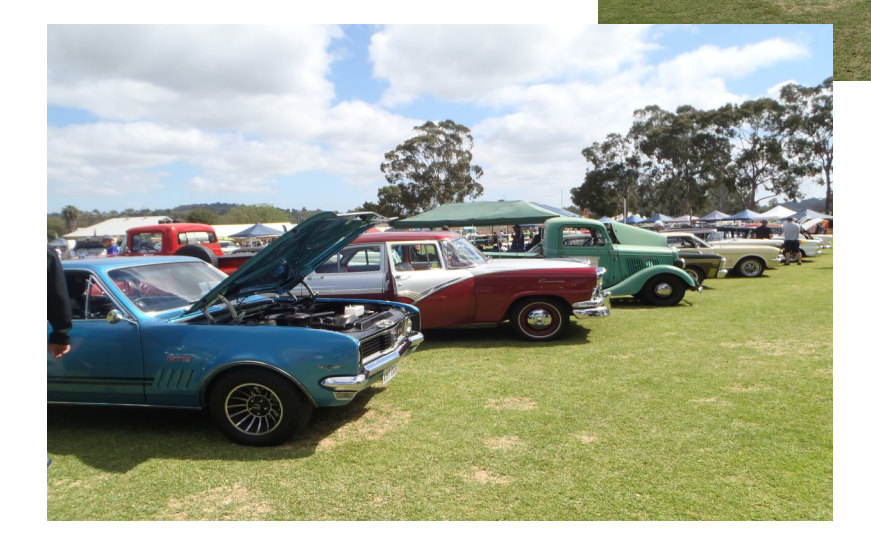
Nice Monaro and Customline